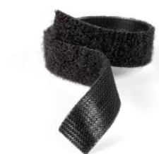
Double sided scratch 2cm wide