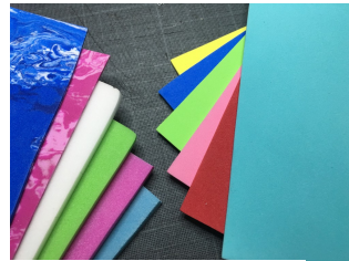
EVA foam 2mm thick