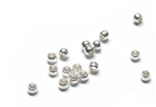
Crimping beads Easier than knots on nylon